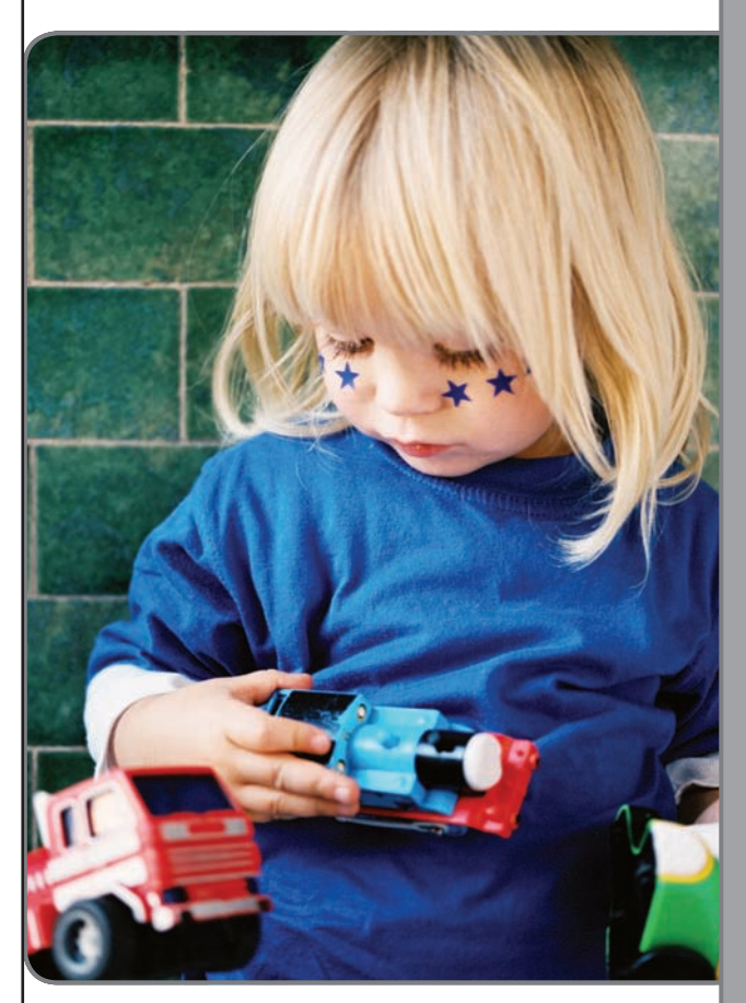
Early Childhood Learning Knowledge Centre c/o Centre of Excellence for Early Childhood Development GRIP-Université de Montréal P.O. Box 6128, Centre-ville Stn. Montreal, Quebec H3C 3J7 www.ccl-cca.ca/childhoodlearning